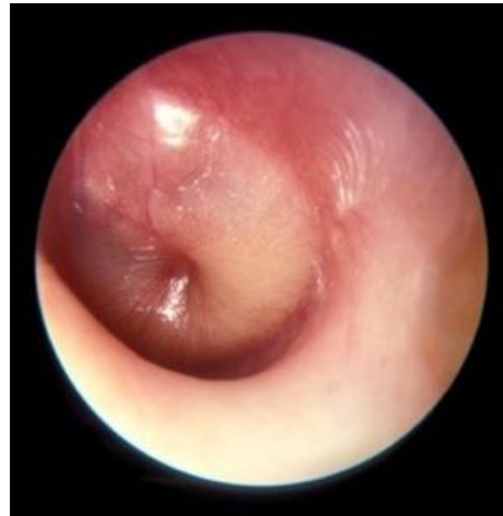
Figure:2 A view of the tympanic membrane showing acute otitis media

The patient has an antecedent event (usually an upper respiratory viral infection) that results in congestion of the mucosa of the upper respiratory tract, including nasopharynx and eustachian tube. Congestion of the mucosa in the eustachian tube obstructs the eustachian tube and negative middle ear pressure develops; if prolonged, potential pathogens (viruses and bacteria) are aspirated from the nasopharynx into the middle ear. Because the eustachian tube is obstructed, the middle ear effusion, due to infection, accumulates in the middle ear, Microbial pathogens proliferates in the secretions, resulting in a suppurative and symptomatic otitis media[12].