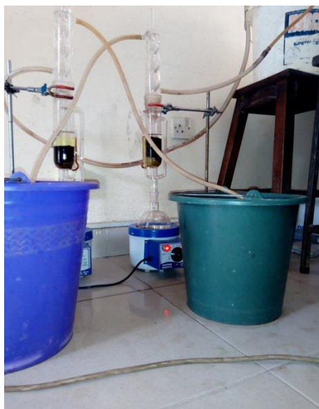
Plate 1: Image of the setup of a Soxhlet Extractor

Twenty grams (20g) of each of the ground leaves was extracted using soxhlet extraction method. For soxhlet extraction, 20g of each of the sample was placed in the thimble which was placed in the sample holder of the extraction chamber of the soxhlet extraction apparatus. The set up was completed and the condenser (containing the water in-let and out-let hoses) as well as the heating mantle was put in place. The quantity of ethanol in the flat bottom flask used was 200ml. Then the heating mantle was connected to the mains to begin the extraction. The process lasted 1 hour after which the extracts were recovered from the ethanol mixture using the Rotary Vacuum Evaporator.